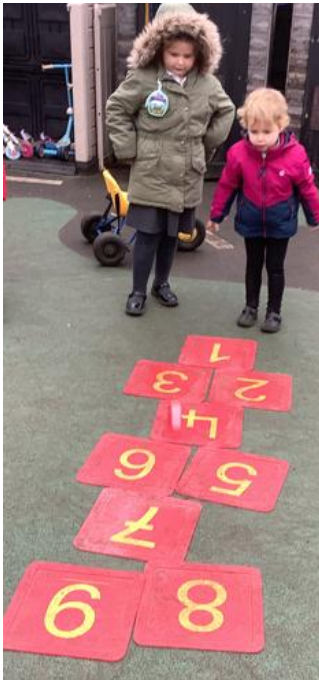
Ladybird and Caterpillar Class - Outside the children decided to work together to play a game of hopscotch.