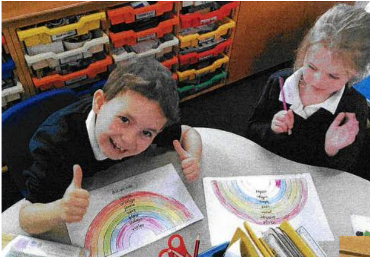
Butterfly Class – We learnt the colour's of the rainbow in French